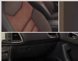
Alcantara® / Textile / Brown Sport Seats EE XE