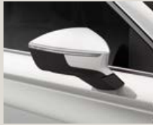
Bila White* St XE