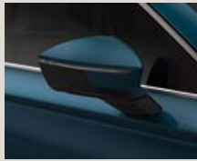
Lava Blue** St XE FR