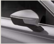
Brilliant Silver** St XE