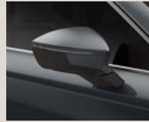
Rhodium Gray** St XE FR