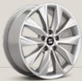
Dynamic 36/01 St