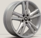
Performance 36/03 FR