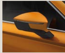
Samoa Orange** St XE FR