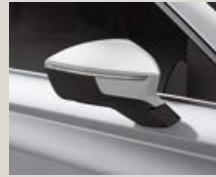
Nevada White** St XE FR