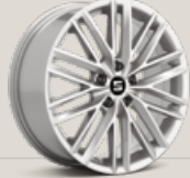
Performance 36/01 XE