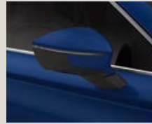
Energy Blue* St XE