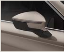
Capuccino Beige** St XE