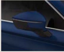
Mediterranean Blue* St XE