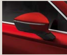
Velvet Red** St XE FR