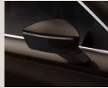
Magnetic Brown** St XE