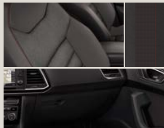
Alcantara® / Textile / PVC Sport Seats ME FR