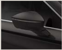
Black Magic** St XE FR