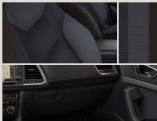
Cloth Comfort Seats BB St